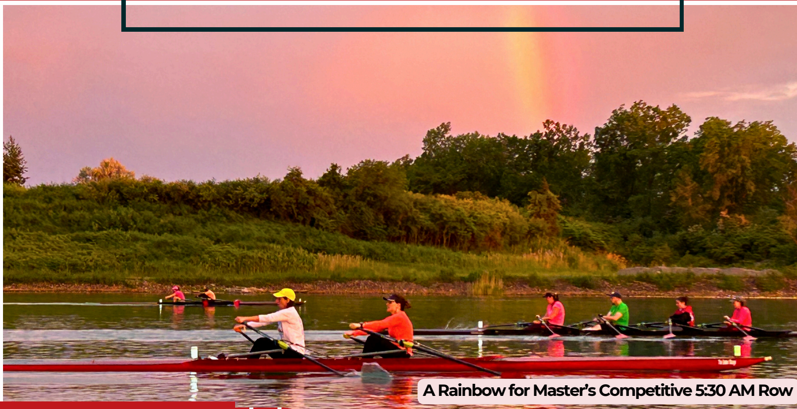
A Rainbow for Master's Competitive 5:30 AM Row